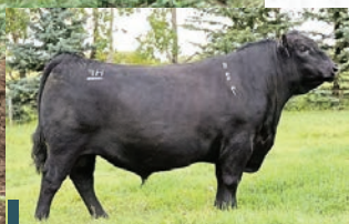
HF ROPER 27F