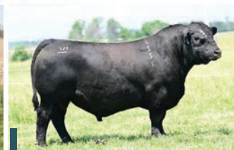
SS HF HI-RANGE 227L