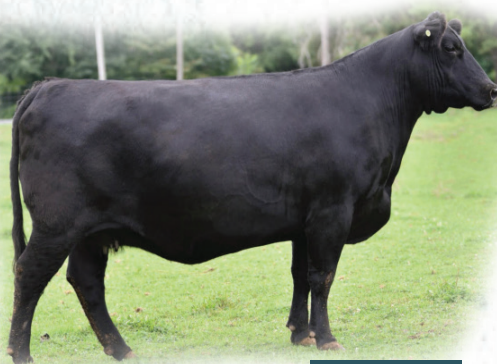
grand dam PREMIER BEAUTY 725