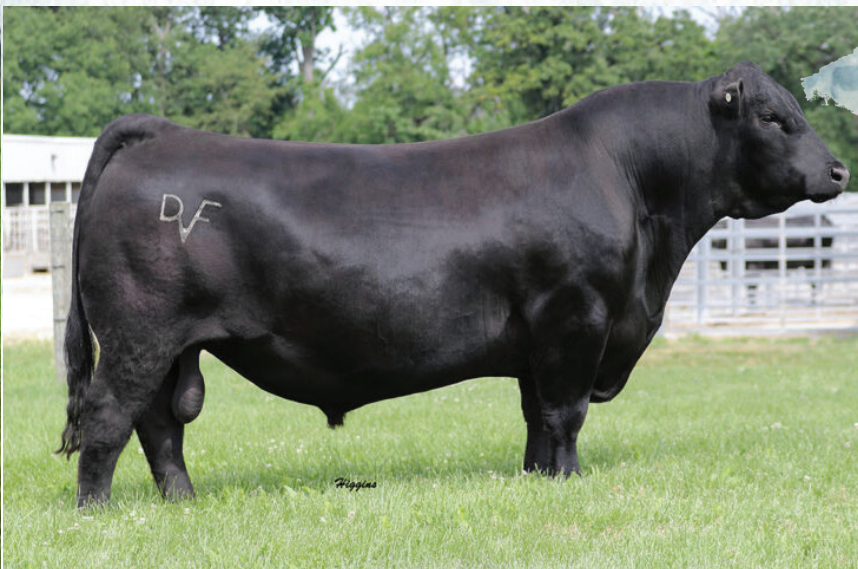
SIRE OF 5M I DEER VALLEY GROWTH FUND