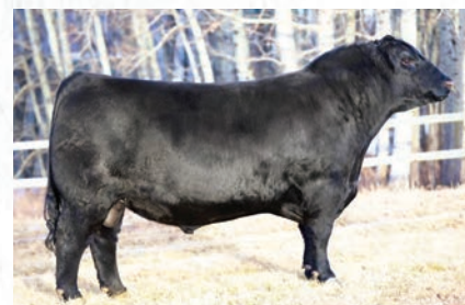
Sire DMM GT LAST CALL 200J

AI BRED TO CONNEALY CRAFTSMAN ON MAY 1, 2025.