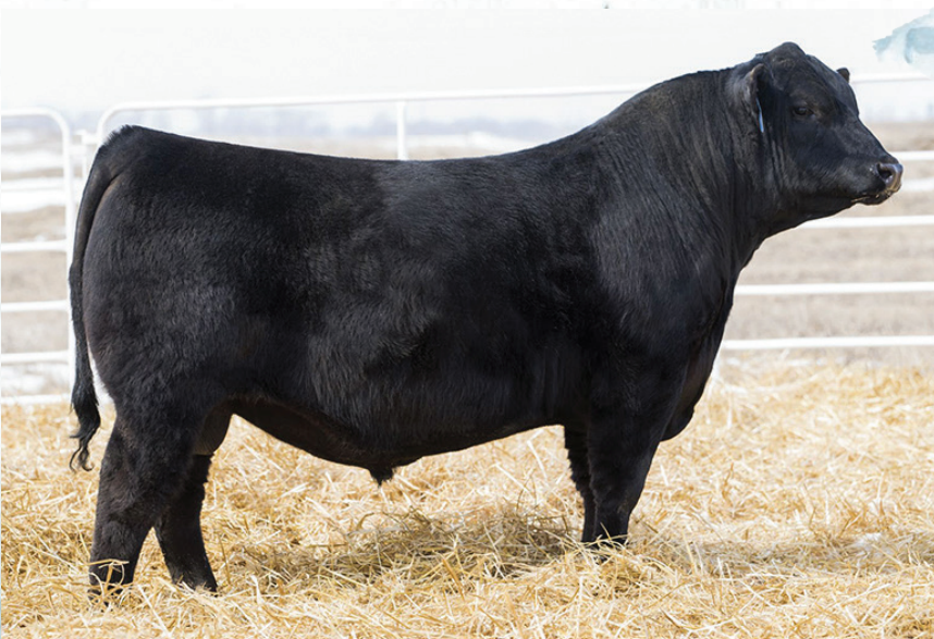
SIRE OF 7M I MOGCK ENTICE