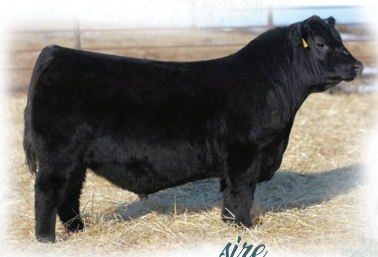
sire BROOKING FIREBRAND 6068

■ A powerfully constructed daughter by Brooking Firebrand 6068, and out of a young Clair Lane Queen cow. This high performing big ribbed heifer calf has natural muscle dimension, and the thickness that we like to see in up and coming brood cows. These Queen females are so consistent in their maternal abilities. They milk, they get bred back, they raise one, and they wean one. Clair Lane Queen 2502 is a 5th generation Queen female to walk at Clair Lane. Every single one of the females in her extended pedigree have the udder quality, and longevity that we all need to move our program forward. Three of these five generational females have hung banners at the Royal. Get on board and be a part of one of the most renowned cow families in Canada.