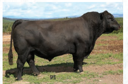
Sire BAR-E-L NATURAL LAW 52Y

■ This heifer is super fancy! I love her neck extension and smooth front end. She is deep with loads of capacity. Zara 4N is very quiet and halter broke. Her sire is the legendary Bar E L Natural Law 52Y. He has a major influence of Angus genetics, and his semen still commands a high price at auction. He sires correct maternal females with good udders. Her dam is a Quaker Hill Columbus daughter that I bought from the Angus Hills dispersal. She is a quiet hard-working cow that catches AI every year. Sells open.