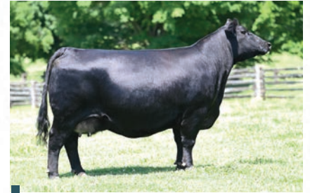
Dam JDL ALLEGRA 2H

AI BRED TO BOYD BEDROCK ON MAY 24, 2025. Checked safe in calf