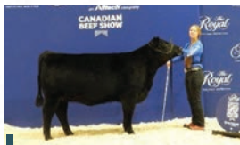
Dam EVENING TINGE