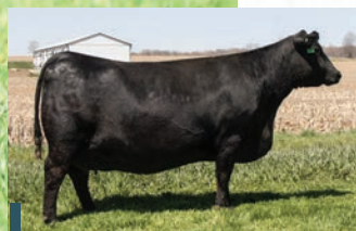
Grand Dam BLACKCAP MAY 631

AI BRED TO LFE BEST ANSWER. EXPOSED TO HF HI-RANGE 227L FROM MAY 6 TO JUNE 30, 2025. Observed bred May 25, 2025. Due to calve February 26.