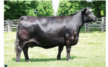
Dam GF ALLEGRA 200E

200N is out of one of our best and most treasured cows, and it shows. Quiet-natured and halter broke, she is a pleasure to work with—ideal for juniors or anyone who values temperament as much as quality.