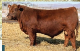
SS EASTWOOD 3284