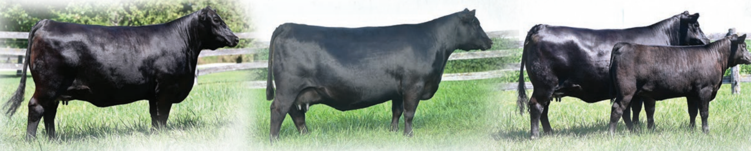
pair 11N WITH HER DAM