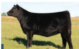
Dam MISS MORGAN 2K