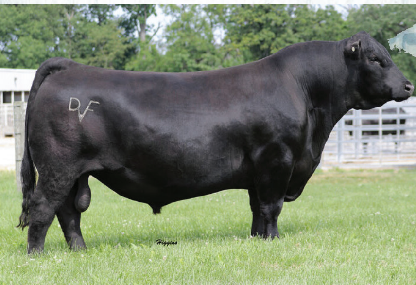
SIRE OF 5M I DEER VALLEY GROWTH FUND