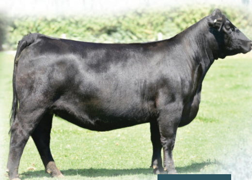
dam WILLDINA ED BEAUTY 183K