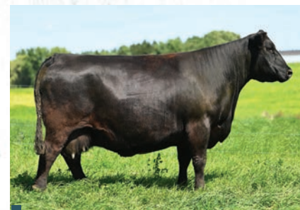
Dam JL EVENING TINGE 8001

AI BRED TO WHISKEY LANE JUKEBOX 2J. Due to calve on February 28.