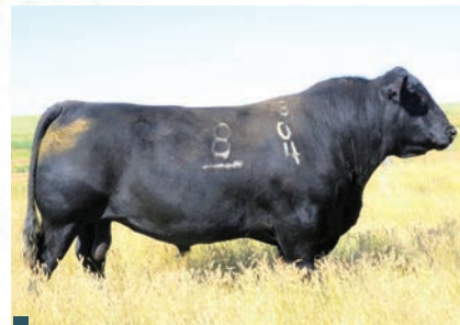
Service Sire B BAR BLACK MASS 3045

Exposed to Sunrise Eric 5Y 12M from May 26 to July 26. Preg checked favourable to the AI breeding date.