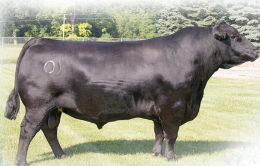
sire RUGGLES CHARISMA 0643

Beauty is a very long bodied female with lots of natural thickness. She is very correct with good feet and legs. She is sired by Ruggles Charisma who is a Confidence Plus son from ABS. He is big topped, big hipped and bold sprung and he has passed that on to this daughter. Beauty's dam is PM Executive Decision daughter I purchased from Wildina Farms. Executive Decision is considered by most to be the best son of Natural Law adding some extra muscle to those females. 183K has a nice tight udder and is long bodied like her daughter. Beauty 13N is halter broke. Sells open.