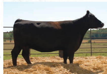
Dam MBT BELLE 104K

■ This beautiful Marvel daughter is one of our favourites this year and we are happy to offer her to you, in support of the growing Bluewater Angus Club. Her pedigree is deep with power, performance, quality udders and solid feet & legs. She is no exception to those traits. She is docile and ready to join your herd to make a strong impact.