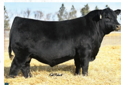
Service Sire S A V MAGNUM 1335

■ Alice 116M is backed by a Renovation dam known for maternal strength and structural integrity. She offers balanced EPDs across growth and carcass traits, making her a versatile addition to any program. Sired by BR MVP, she brings added muscle expression, fleshing ability, and body depth, all wrapped in a gentle, easy-handling disposition. Bred to Magnum for added performance and style. Will be parent verified and genomic tested by sale day. AI BRED TO S A V MAGNUM 1335 ON MAY 1, 2025.