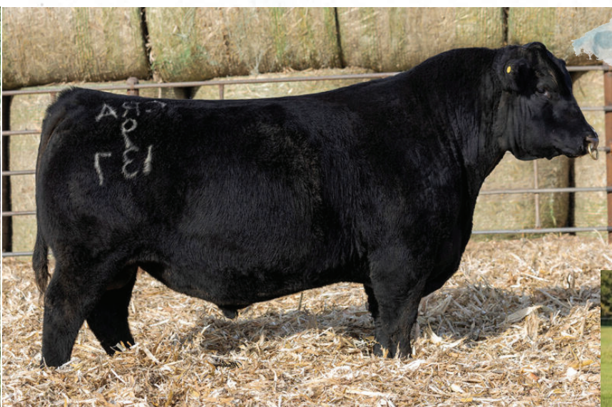
SIRE OF 6M I CRAWFORD GUARANTEE 9137