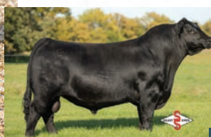
SS GIBSON G859