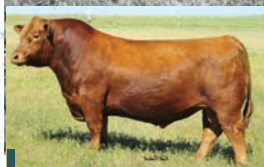
Sire NO WORRIES 4657B