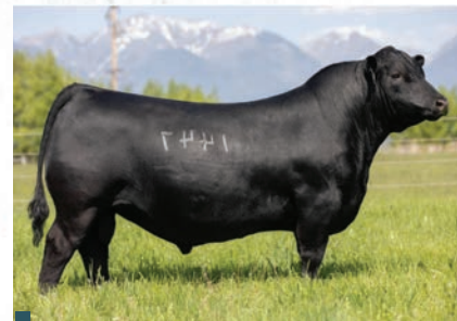
Service Sire COLEMAN MISSION 1447

■ Big-time genetics. Proven in the ring. Built to produce. Sired by Deer Valley Growth Fund - a widely respected Angus sire known for combining elite performance traits with maternal quality - she is the proof. Class winner at both the Masterfeeds National Junior Beef Heifer Show and the Charlie Watson Memorial Bred & Owned Show at the 2024 Royal Agricultural Winter Fair. AI BRED TO COLEMAN MISSION 1447 ON APRIL 11, 2025. Exposed to Clear Brook Landslide 4L. Vet favours AI date.