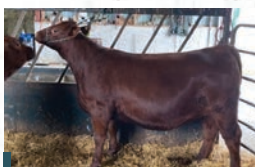
Dam LITTLE WESTERN