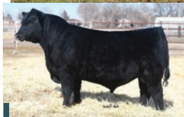
Sire ICONIC G95