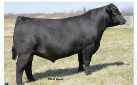
Service Sire S A V BRILLIANCE 8077

Exposed to Whiskey Lane Moonshine 12M, a son of Brookdale Brutus, from May 4 to May 30. Ultrasound preg check favours safe to AI service.