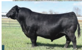
Sire JUSTIFIED 3023